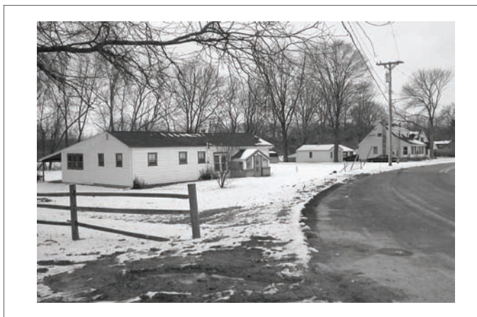
The new Library will replace houses along Alpine Street, just north of the newly renovated Farmer’s Market area

The Dexter District Library will begin an exciting new chapter in the Library’s development in 2006 by moving forward with its building project. After the successful November election, the Library is now ready to complete the design process and begin building its new facility on Alpine Street. Through the course of the design process, the Library’s planning committee will work closely with Holzheimer, Bolek Architects to address the functional and aesthetic building needs. This process will continue over the next few months and will involve finalizing the space and area layouts inside the building. Updated plans will be on display in the Library as they become available. The construction of the new Library will take approximately two years to complete and involves many